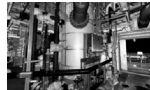
LEFT Model of Gorm Platform