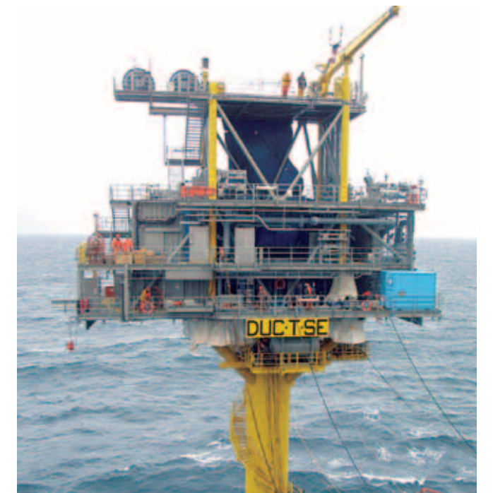
The South East Tyra mono-column under commissioning.