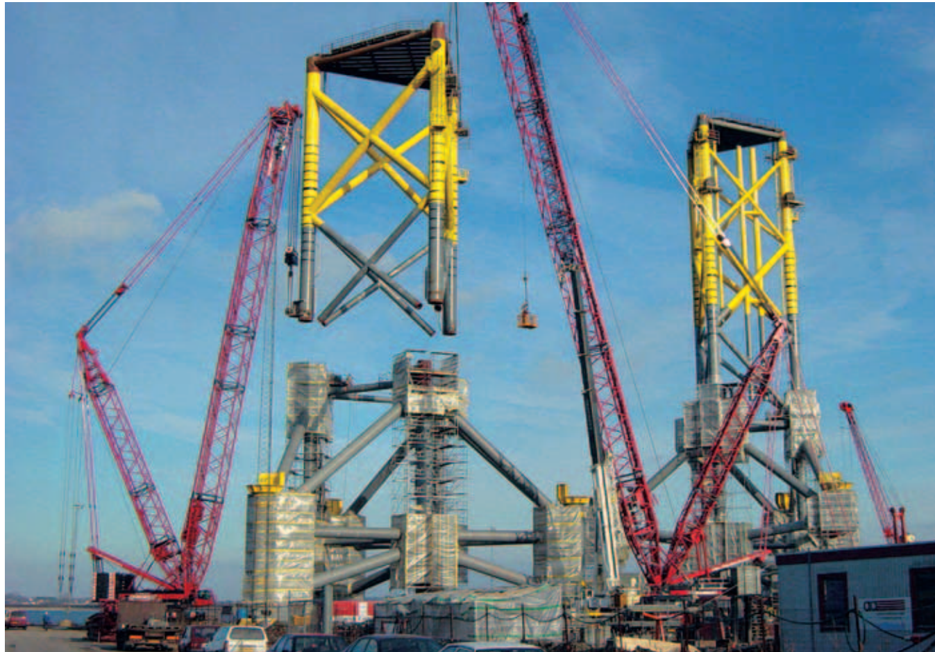
Small "twisted tower" platforms for the Halfdan field.